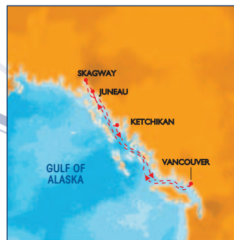
--- GLACIER BAY